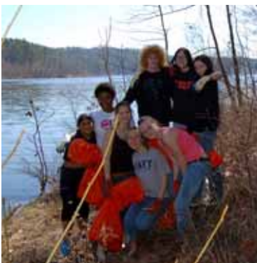
Woods Charter School students clean up Robeson Creek Access.